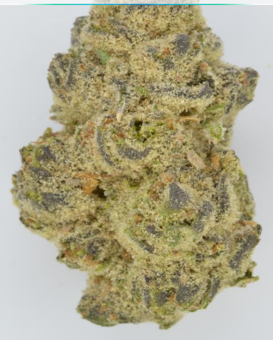
Lava Cake 8-12-21