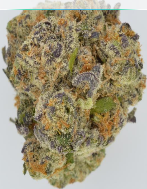
Sundae Driver 8-12-21

No Pesticides Were Detected above Oregon's action limit as stated in OAR 333-007-0400.